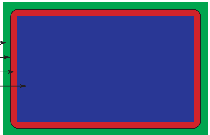
EXAMPLE OF A CREDIT CARD SIZED CARD